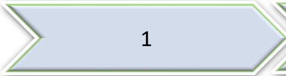
HT Power Station 500 KVA