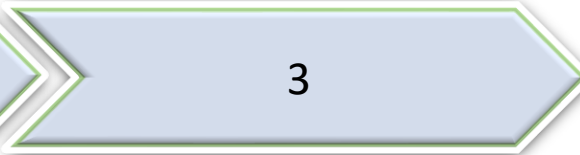
Power backup 125 KVADG