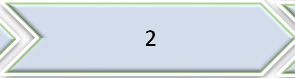
Spare 200 KVA Capacity